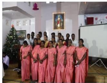
PARA CLINICAL STAFF