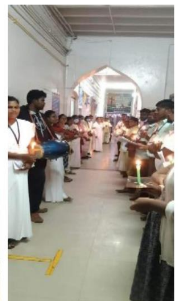
NURSING - WARD CAROLS