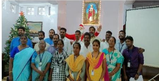
PHARMACY, DRUGSTORES & GENERAL STORES