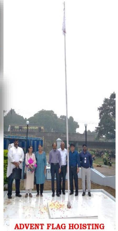
ADVENT FLAG HOISTING