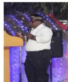
RPT - COMMISSIONER