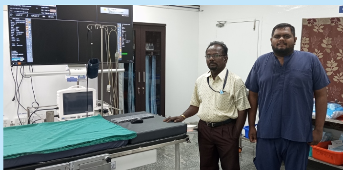
Cath. Lab Technicians