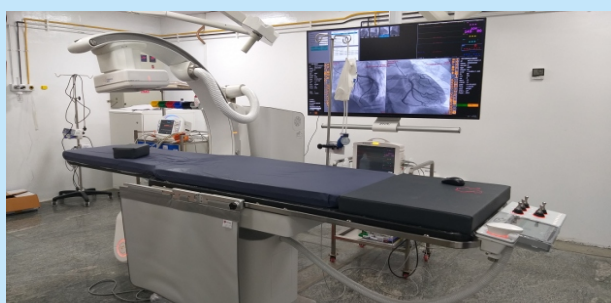
Pinnacle Agile Cath Lab Unit