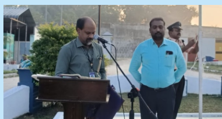
Republic Day Flag Hoisting