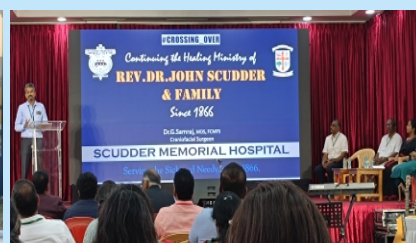
Mission Retreat at IMC